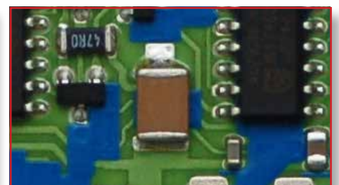
x12 zoom, 30x magnification