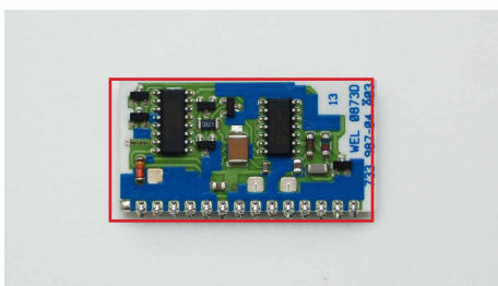
x1 zoom, 2.5x magnification

”Optimized for optical inspection and repair of electronics PCBs”